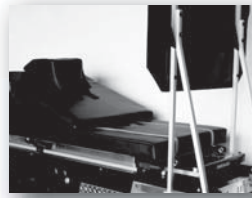
*Included with Recovery SR model or can be purchased separately.

Oversized for a variety of activities, the 24” x 30” kickplate has a removable rubber pad with soft foam for joint protection.